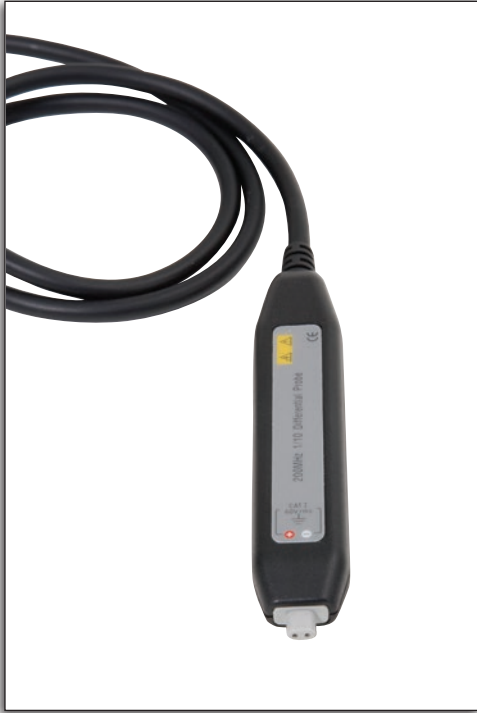
The ZD200 provides 2 closely spaced differential inputs to connect directly to header pins, or connect probe tips or leads.