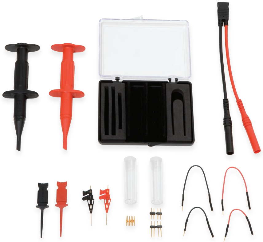
The ZD200 Accessory kit includes an assortment of leads, clips, and straight tips.